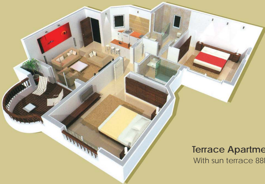
Terrace Apartment With sun terrace 88M 2