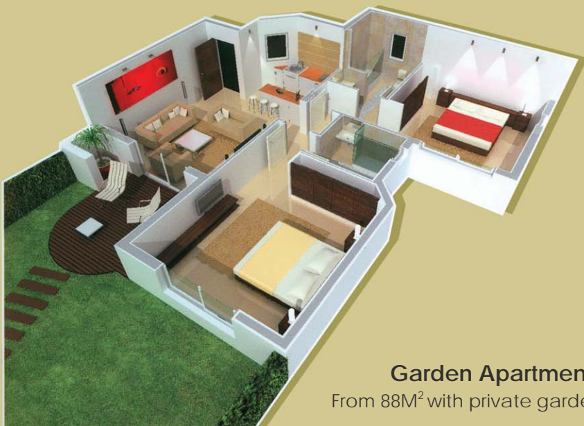
Garden Apartment From 88M 2 with private garden 50M 2