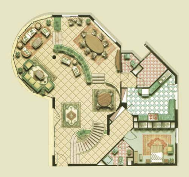
Ground Floor Total 170 sqm - Full furniture