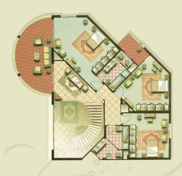
Upper Floor Total 170 sqm - Full furniture