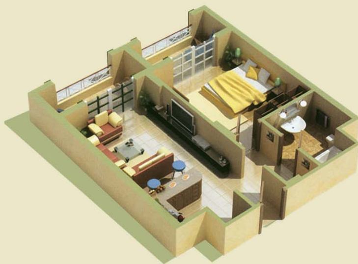
1 Bedroom Apartment From 62M 2