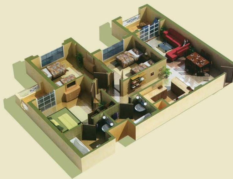
3 Bedrooms Apartment From 110M 2