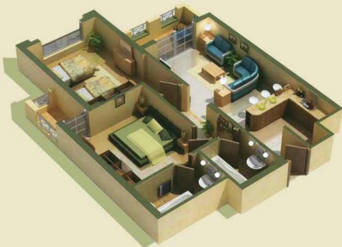
2 Bedrooms Apartment From 87M 2