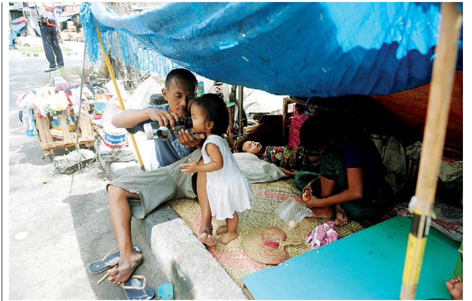
MANILA: A homeless family lives on a makeshift house along a street in Manila yesterday. The Philippines has failed to make headway in cutting rampant poverty, with more than one in four citizens deemed poor despite the country's economic growth, according to census figures released yesterday.